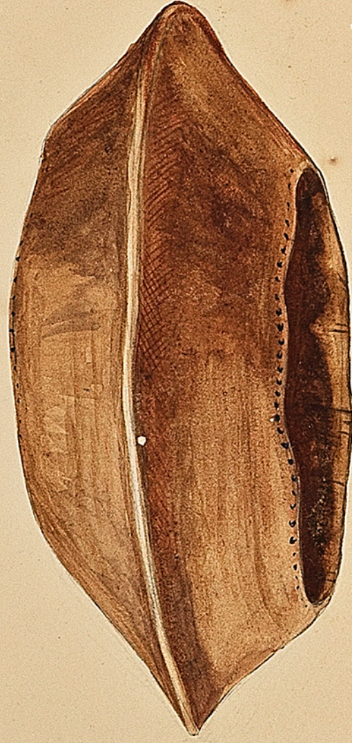
Bracelet en bois venu du Soudan par le Sénégal. Exemple de gros bracelets portés communément en Afrique.