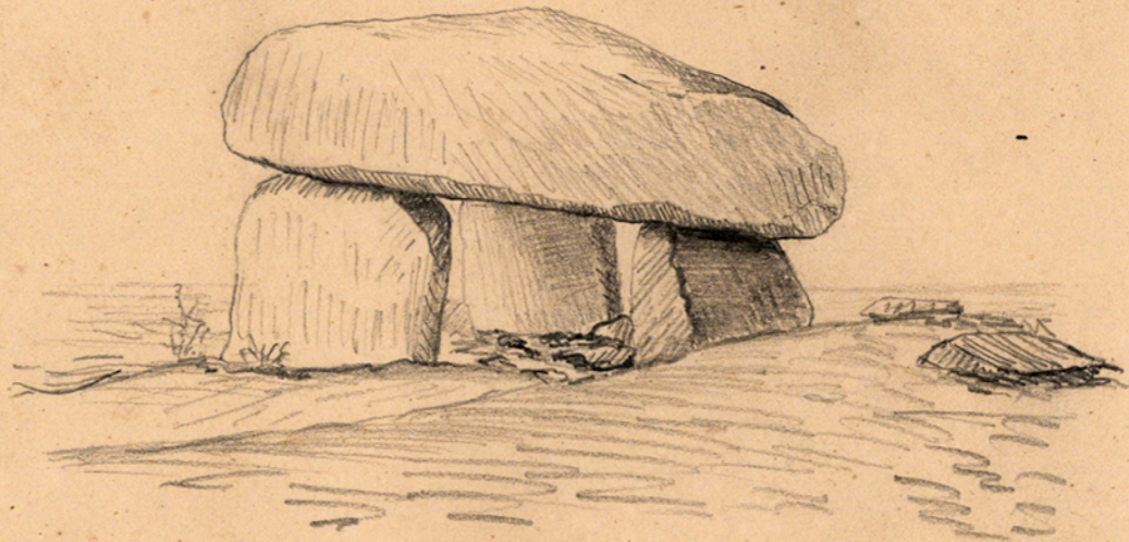
Dolmen de Reignier près La Roche. Age de la pierre.